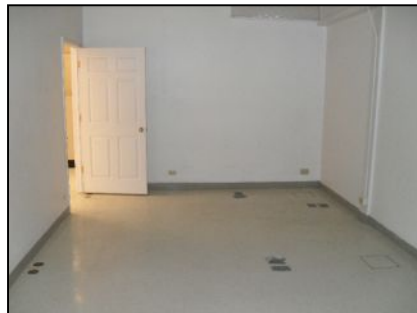
Private Conference Room